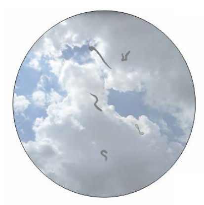
Vitreous floaters as perceived by the patient